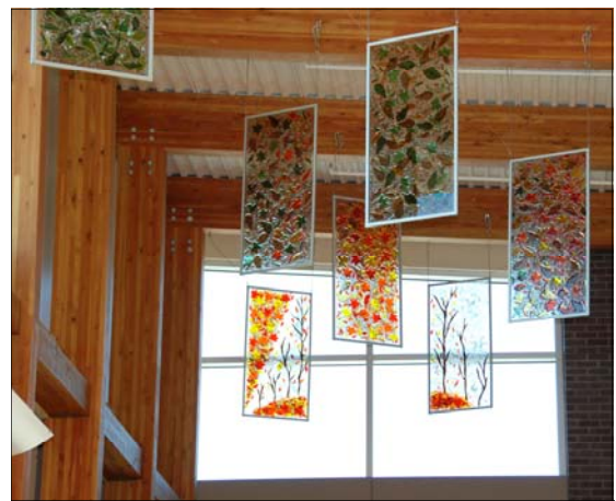
Beautiful Glass Artwork hangs from the ceiling

Another element of the project is a technologically advanced Pharmacy, providing "to the minute patient medication". The new Pharmacy will be located in the vacant space in the Laboratory area and construction is presently underway.