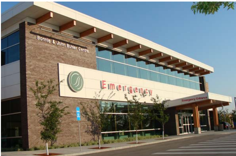
A Ribbon Cutting Ceremony, officially opening the new Bonnie and John Buhler Centre, was held on Monday, August 18th.